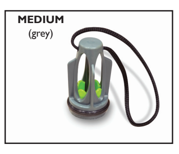
*Colors are not optional For most current updates, please check our website at: http://www.oceankayak.com/product_support/downloads.html